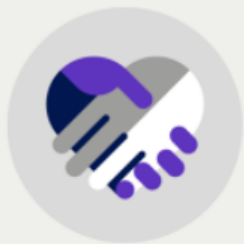
Clarivate Volunteer Network