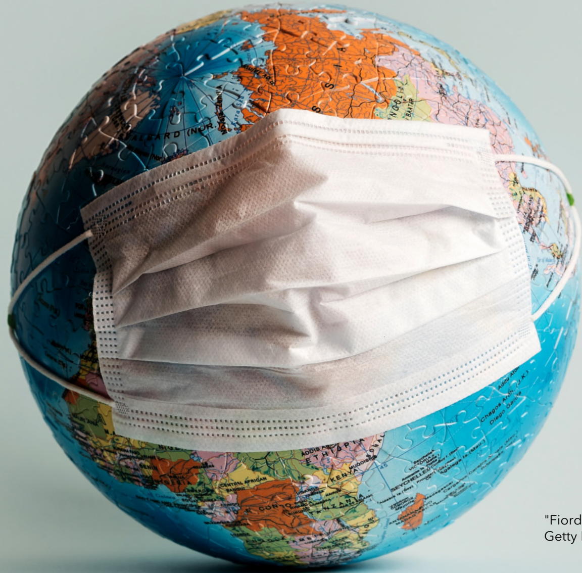
"Fiordaliso/Moment/Getty Images", or as otherwise shown on the Getty Images Website. 5.4 Audio/Visual Production Credit.